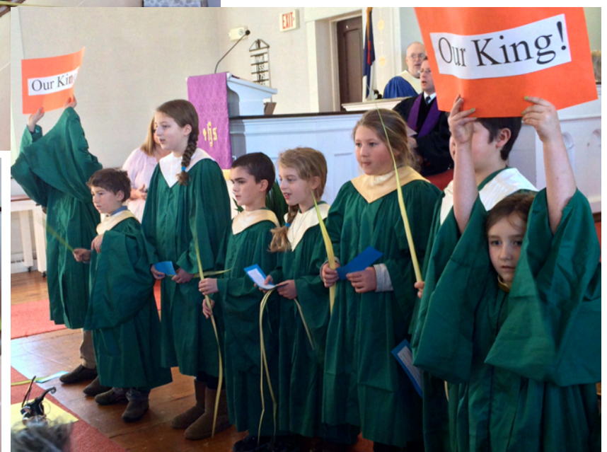
Hosannas to Alleluias! The Church School children offer a pageant for Palm Sunday, with congregational participation...