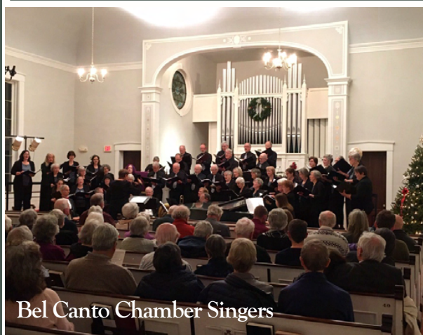
Bel Canto Chamber Singers

FCC is delighted to host this increasingly popular venue for live, local music! An informal "listening room" for established and emerging musicians, each show features several acoustic acts, and patrons may come and go as they wish. Baked goods and non-alcoholic drinks available. And it's all free of charge, so please come and enjoy! For more information, please visit anoncoffee.org or email anoncoffeehouse@gmail.com .