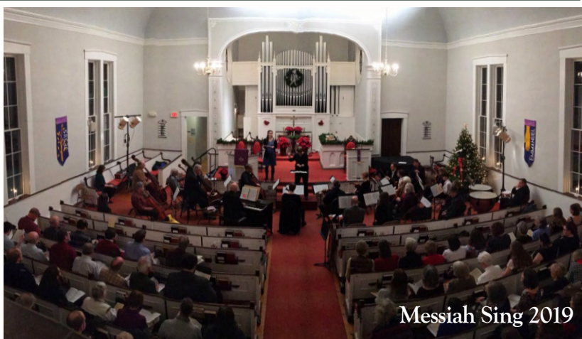
Messiah Sing 2019