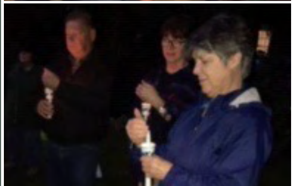
VIGIL FOR IMMIGRANT RIGHTS. FCC hosted this lively community forum, organized by UVIP.