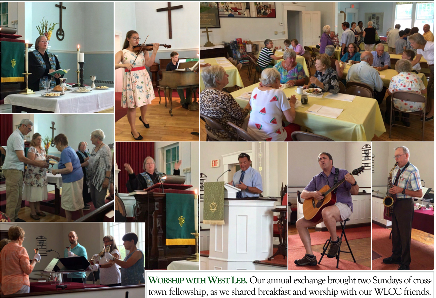
WORSHIP WITH WEST LEB. Our annual exchange brought two Sundays of cross-town fellowship, as we shared breakfast and worship with our WLCC friends.

Don't miss this incredible opportunity to build community and faith amidst God's creation!